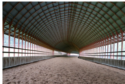
The covered uphill gallops at Chiyoda

The farm's website declares that Chiyoda is "where horses reign supreme," and the Iida family's underlying passion becomes clear as soon as visitors arrive. Iida maintains a spacious home adjacent to broodmare barns and overlooking a 1000-meter oval track, all surrounded by trees and lush greenery.