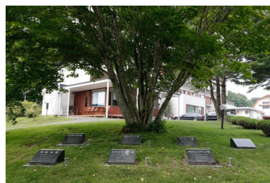
The cemetery at Chiyoda