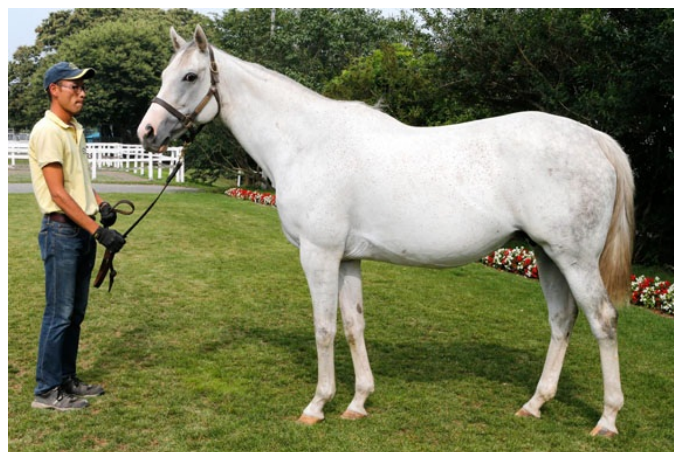
Star of Sapphire

Home Sweet Home (Seeking the Gold), a full sister to Breeders' Cup Distaff winner Pleasant Home and to the dam of Point of Entry and Pine Island;