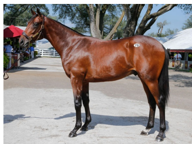
Street Cry colt hip 70

Sense filly out of Million Gift's stakes-winning daughter Million Seller (A.P. Indy) ( hip 71 ) ( Keeneland pedigree ). The filly's catalog page also features marquee names like Grade I winners Point of Entry (Dynaformer), Violence (Medaglia d'Oro), Pleasant Home (Seeking the Gold),